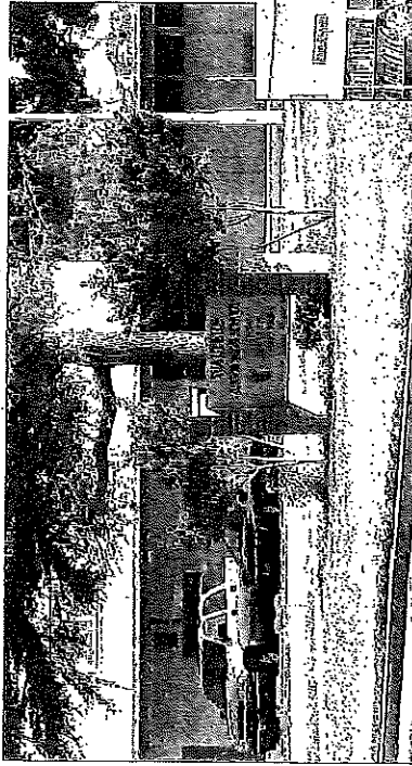
(Above) Walters Junior High (grades 7-8) is one of the first schools to be converted to a middle school (grades 6-8). (Right) Members of the FUSD Middle School Instructional Task Force discuss research, identify best practices, and begin to develop program recommendations.