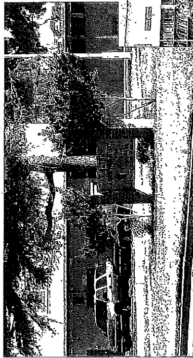
(Above) Walters Junior High (grades 7-8) is one of the first schools to be converted to a middle school (grades 6-8). (Right) Members of the FUSD Middle School Instructional Task Force discuss research, identify best practices, and begin to develop program recommendations.